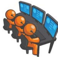
Boxpilot Call Center